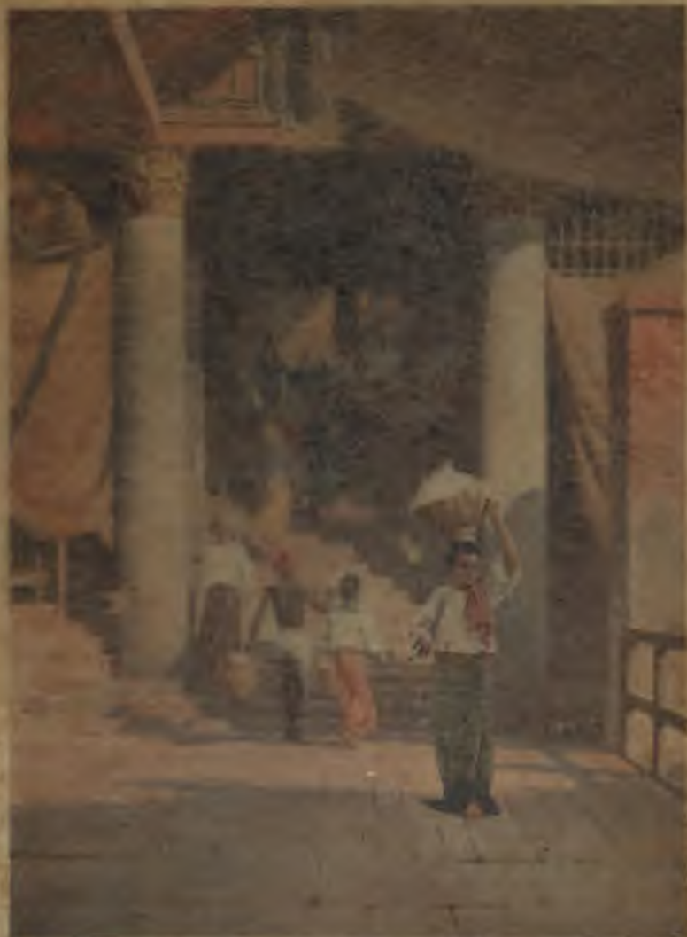
THE PANGO-ARELE REGION.